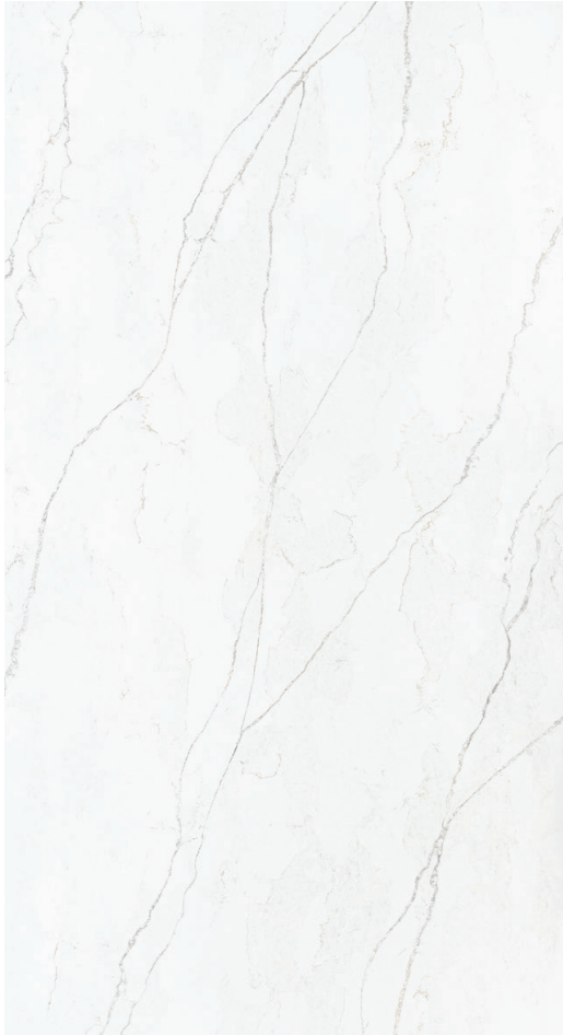
1601 - Thela Perla